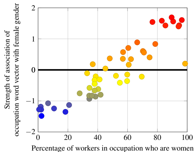
Figure 1. Occupation-gender association Pearson's correlation coefficient \rho = 0.90 with p -value < 10^{-18} .

The primary difference between WEFAT and WEAT/IAT is that each target.