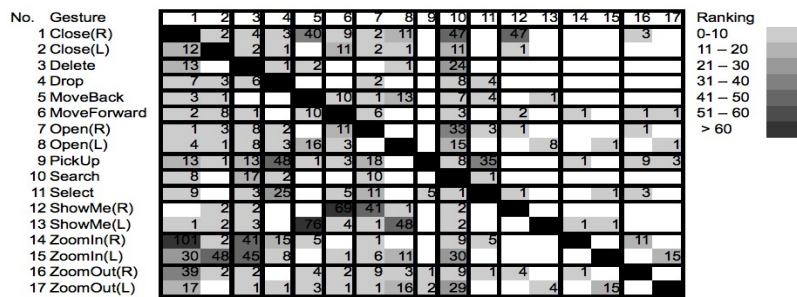
Fig. 3. Confusion Matrix – 61% accuracy: each gesture is shown relative to the gestures with which the system confused it.

System Recognition Rates In order to evaluate the performance of our 3D gesture recognition system we followed a leave-one-out testing strategy to derive an overall accuracy rate as well as a break down of the gestures that were misidentified by the system. Leave-one-out testing involved training the HMM model on all the training data of all but one participant. The omitted participant's data was then input into the system and the output was the identification of the gesture by the HMM based system, from which we were able to evaluate the accuracy of the gesture recognition system.