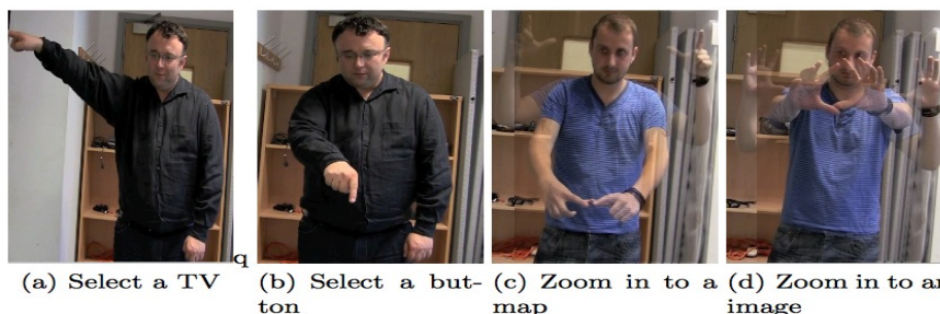
Fig. 1. Different directions and orientations performed by participants when asked to generate gestures for different tasks.

predominance of 3D gestures in the gesture set we derived from Study 1, there would appear to be a need for gesture recognition systems that can recognize gestures in 3D.