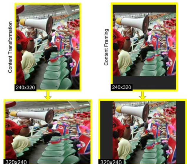
Figure 4. An example of content transformation (left) in comparison to content framing (right).

In comparison to content transformation, content framing doesn’t make the most of the entire pixel repertoire provided by the mobile device, which can be a restricting factor given the already limited pixel range available on most mobile devices.