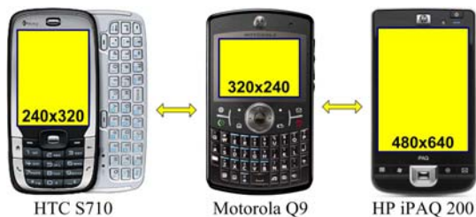
Figure 3. Illustration of some of the different mobile devices and resolutions available.

Enabling mobile to mobile connections, creating shared interaction spaces and carefully optimizing the client software has allowed us to extend our photo-conferencing capabilities across a large number of mobile devices currently available on the market, from low-end Smartphones to more powerful Pocket PC devices. In today’s mobile market consumers are however presented with a greater choice of devices, form factors and screen resolutions to meet their individual needs (see Figure 3). These variations present new challenges in screen adaptation that mobile services need to overcome in order to succeed.