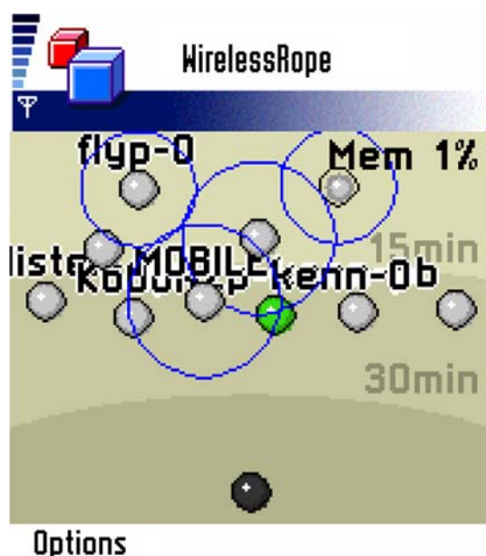
Fig. 1 A screenshot of the Wireless Rope J2ME software. The black circle represents the owner, while devices in the environment are classified as familiar ( green ) or strangers ( grey ). Devices move closer to the black circle as they spend more time within range

The majority of our analyses described here are focused on gatecount and static snapshot datasets gathered in the city of Bath, UK. Analysis of the gatecount datasets allowed us to identify interesting mobility and temporal patterns as well as facts and figures about the UPI. First, we used gatecount datasets to infer patterns and trends during the movement of people across the city. Patterns are observable on many scales, from hourly to seasonal. Additionally, we have been able to identify facts and figures such as the overall penetration of Bluetooth in a city. Specifically, in Bath (UK) we found that about 7.5% of pedestrians carry mobile phones with Bluetooth set to discoverable mode [14], while in Bremen (Germany) there were 3.5% and in San Francisco (USA) 13.5% 13 . Furthermore, we can use our data to identify device classes or indeed device brands. For example, on our campus 35% of logged phones were Sony-Ericsson, while 22% were Samsung and 21% were Nokia. Knowledge of the mobile devices in a city (e.g. brand and operating system) may be an influential factor for the development of applications. As part of our ongoing work we are exploring different statistical methods to improve the accuracy of our sampling method, such as analysing data captured by multiple simultaneous scanners, or data captured at extremely busy locations.